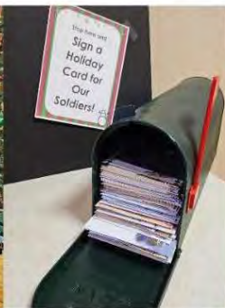
Holiday Cards for Our Soldiers