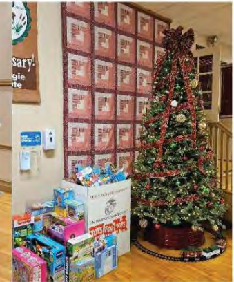
Toys for Tots Collection