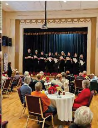
Macungie Senior Residents Holiday Luncheon