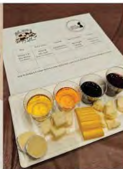
Wine & Cheese Tasting