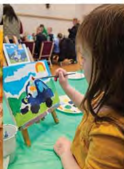
Painting with the Police