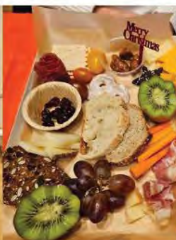
Charcuterie Board Class