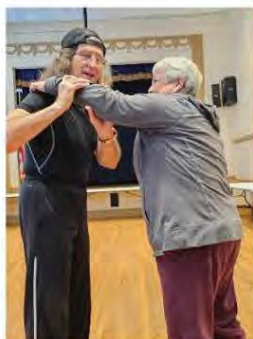
Self Defense Class for Seniors