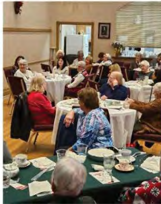
Friends Holiday Victorian Tea