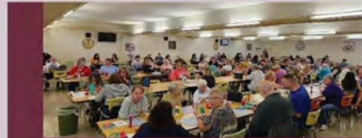
Friends Fall Bingo at Macungie Memorial Park