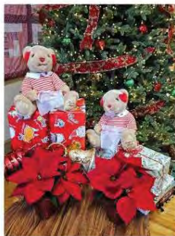
The Willow Angel Tree

We enjoyed a busy Fall and Winter at the Institute! Thank you to everyone who supported these events!!